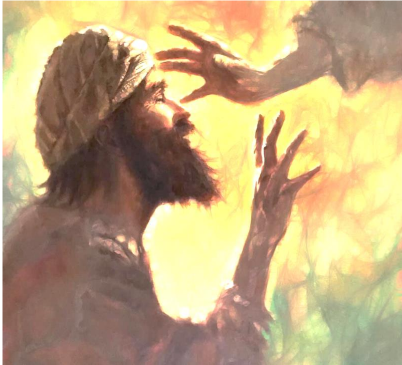
Blind Bartimaeus - Unknown

God's discerning, inclusive, Christ-centered church, engaged in outreach ministry, growing discipleship, and life changing worship.