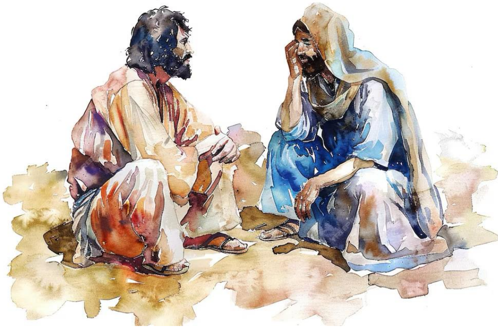
Watercolor Painting of Jesus and Rich Young Ruler AI Generated Art

God's discerning, inclusive, Christ-centered church, engaged in outreach ministry, growing discipleship, and life changing worship.