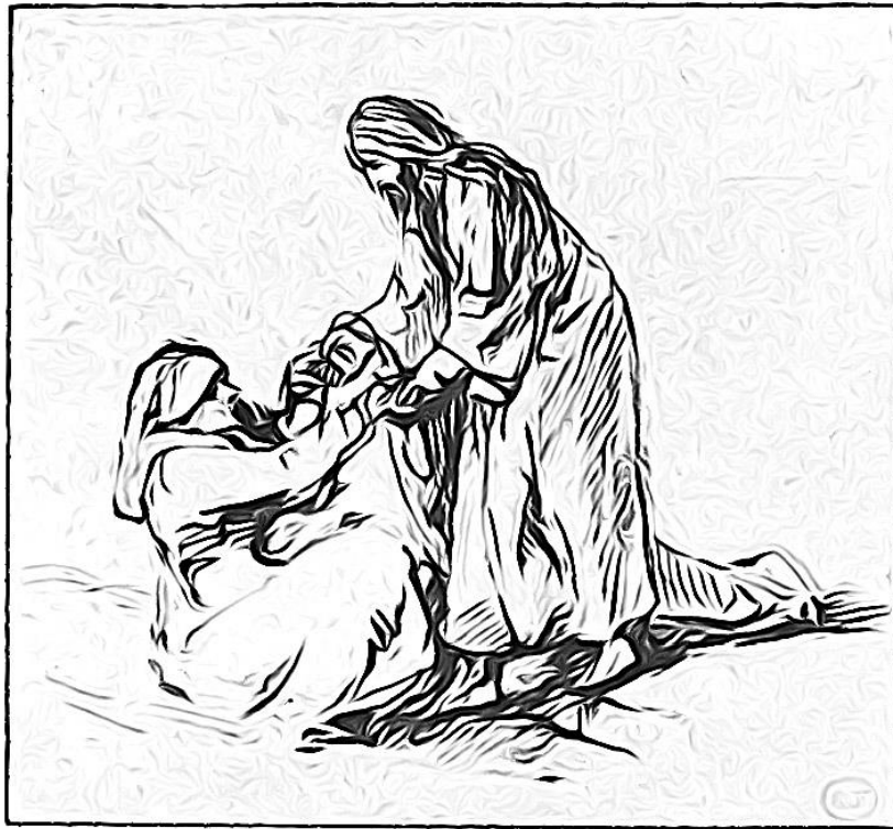
Rembrandt Harmenszoon van Rijn, Christ Healing Peter's Mother-in Law.

God's discerning, inclusive, Christ-centered church, engaged in outreach ministry, growing discipleship, and life changing worship.