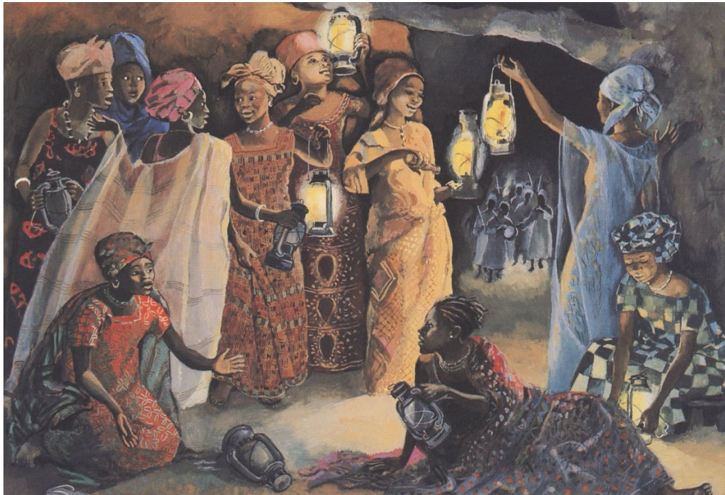
The Ten Young Women – JESUS MAFA

God's discerning, inclusive, Christ-centered church, engaged in outreach ministry, growing discipleship, and life changing worship.