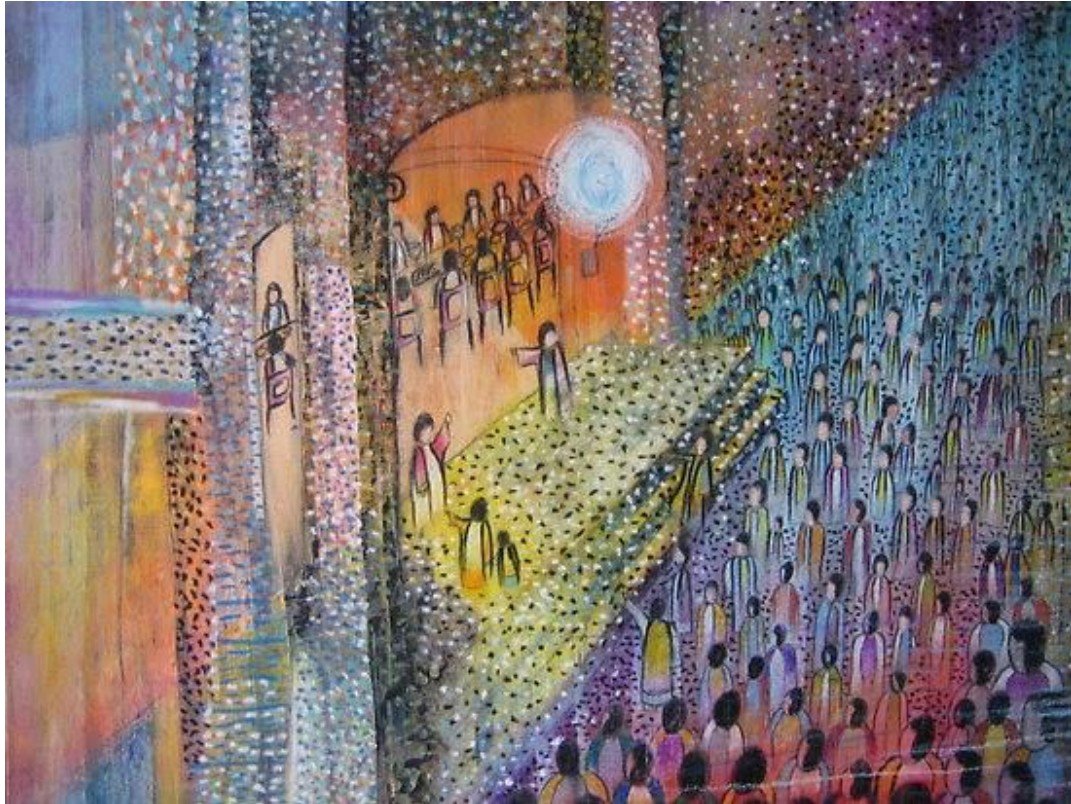
The Great Banquet – Artist Unknown

God's discerning, inclusive, Christ-centered church, engaged in outreach ministry, growing discipleship, and life changing worship.