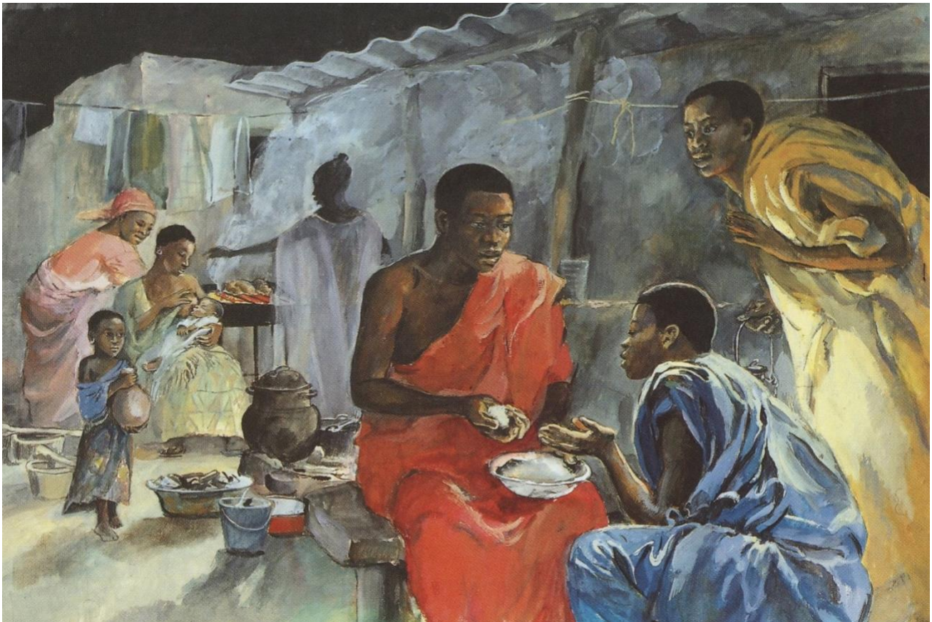
Artist: Jesu MAFA – Jesus appears at Emmaus

God's discerning, inclusive, Christ-centered church, engaged in outreach ministry, growing discipleship, and life changing worship.