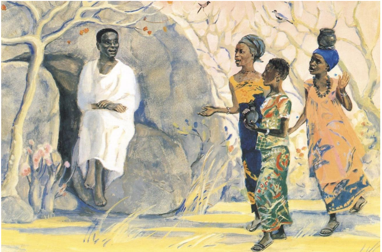
Artist: JESUS MAFA – Easter, Empty Tomb

God's discerning, inclusive, Christ-centered church, engaged in outreach ministry, growing discipleship, and life changing worship.