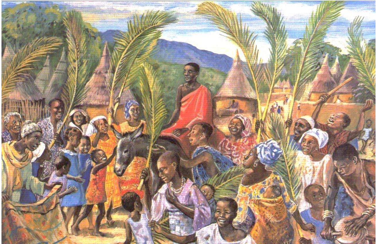
Artist: JESUS MAFA – The Triumphal Entry

God's discerning, inclusive, Christ-centered church, engaged in outreach ministry, growing discipleship, and life changing worship.