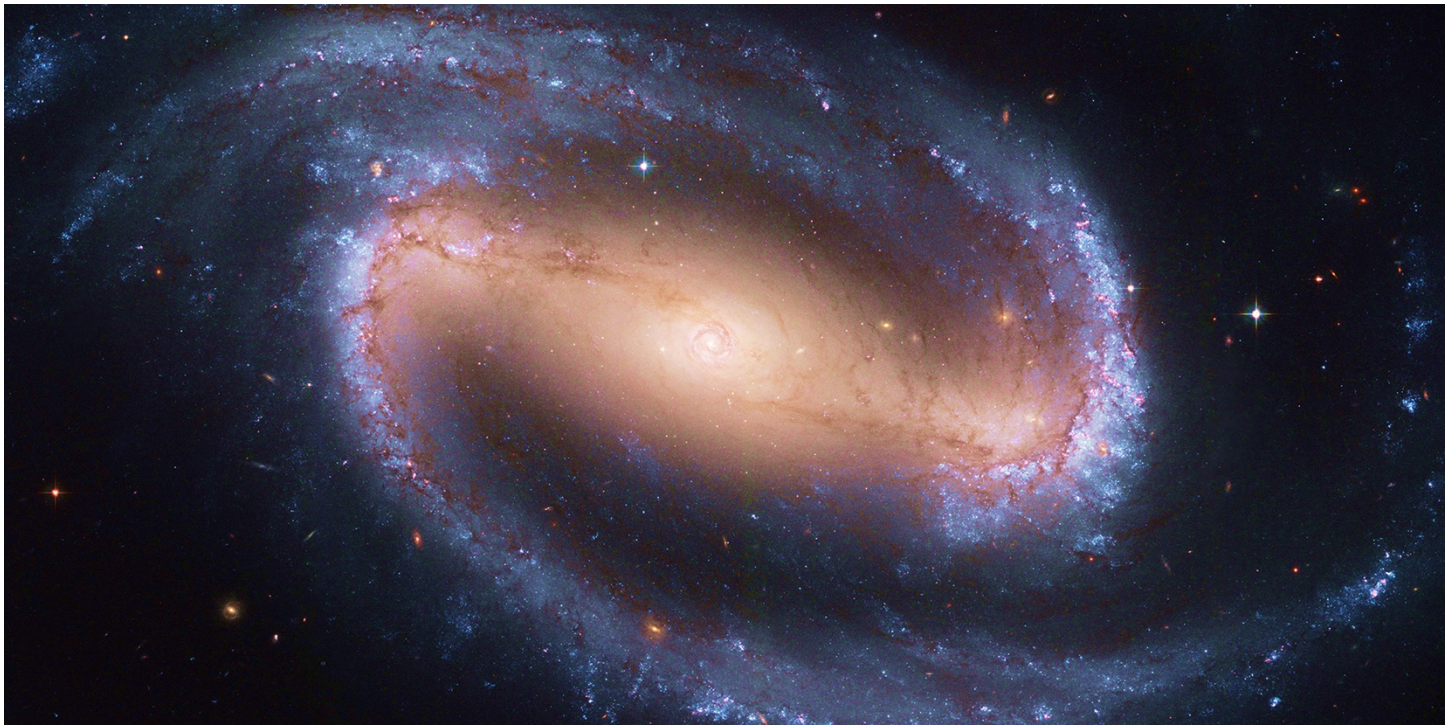
Barred Spiral Galaxy NGC 1300

Christ the King Sunday | November 20, 2022 8:00 am and 10:00 am