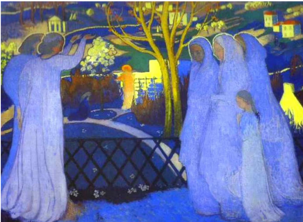
The women at the empty tomb (Luke 24).

God's discerning, inclusive, Christ-centered church, engaged in outreach ministry, growing discipleship, and life changing worship.